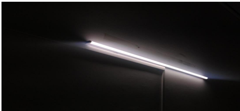
Photo: Replacement of Conventional Tube lights with LED Tube

The institution is regularly replacing tube lights (36 Watt) with 18 W LED Lights. The tube light which is not working is replaced with the LED bulbs.