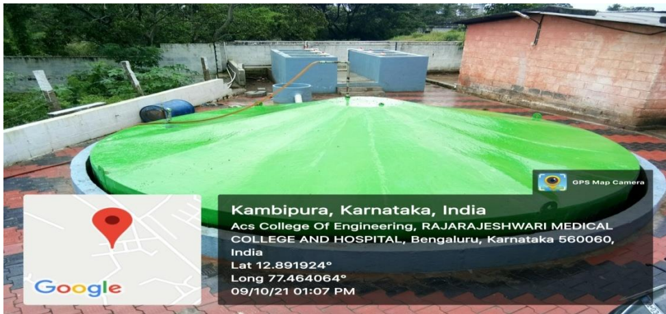
Photo: View of the new Biogas Plant at ACSCE