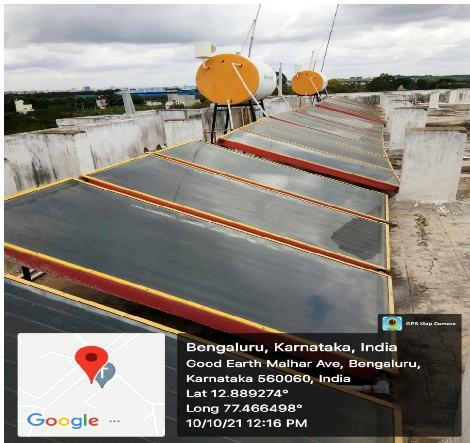
Photo: Solar Panels for water heating

In order to conserve the electrical energy in the boys and Girls Hostels, a total of 96 Solar Water Heating Panels and 12 tanks have been installed and operated on day today basis. This has eliminated the use of electrical geysers in the hostels as the hot water is required round the year in Bangalore climate