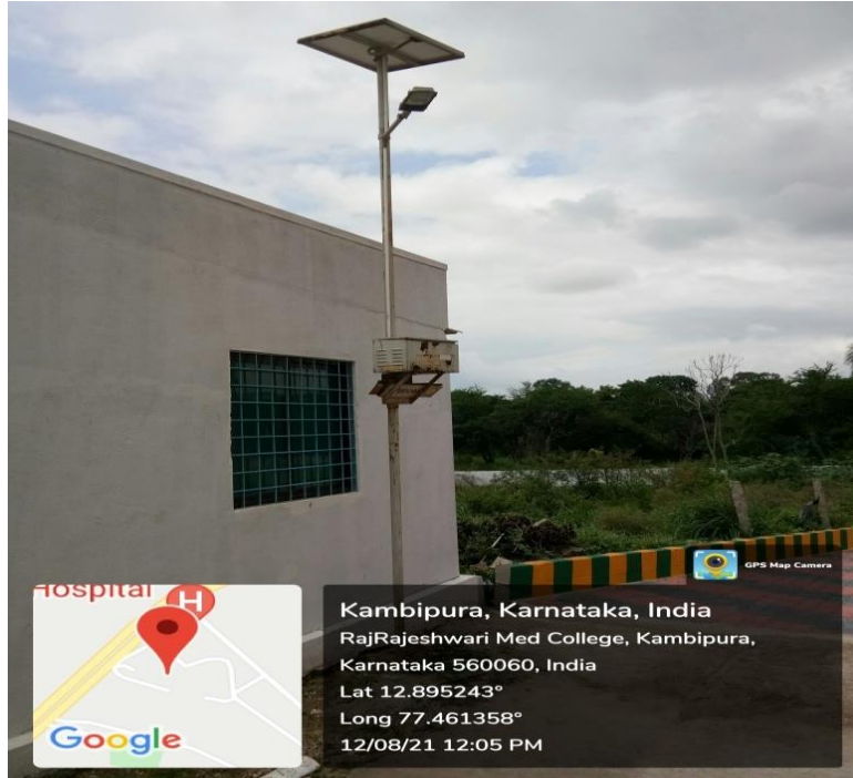
Photo: Solar Street Light

The Solar street lights are also installed in various part of the campus in order to reduce the conventional electricity usage