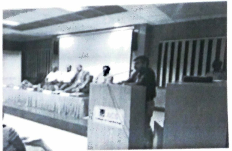
Photo: Welcome address by HOD, CSE