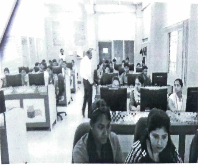
Photo: Workshop session