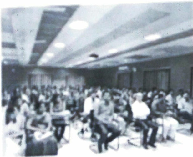
Photo: Participants in Events