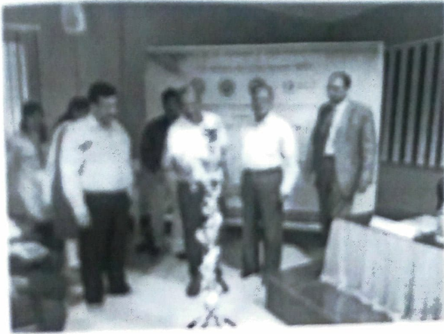
Photo: Lamp Lighting by Resource Person