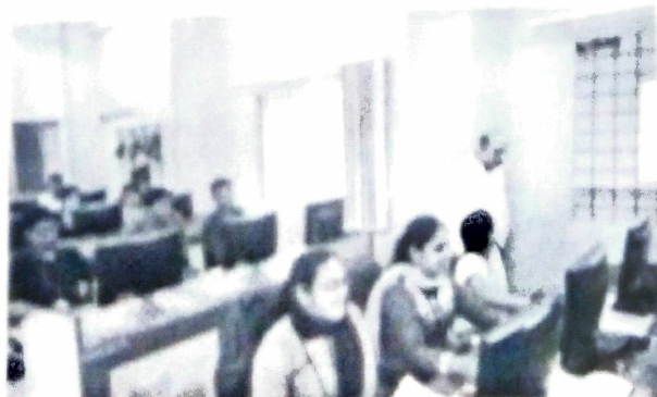
Photos: Workshop session