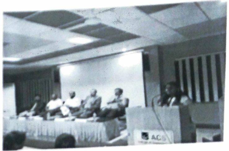
Photo: Dignitaries and resource person