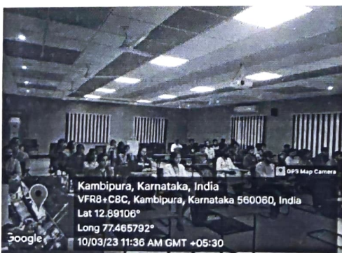
CTDS INSTITUTION COORDINATOR

Future of Measuring production processes and parameters against industry standards. Establishing validation standards and developing performance testing and quality control measures. Calibrating equipment to function within acceptable parameters. Developing test procedures that produce analyzable validation data. Analyzing test data to determine the causes of defects, failure, or flaws and facilitating corrective measures. Performing risk assessments and ensuring compliance with industry standards. Conducting preventative maintenance, as well as repairing or replacing equipment.