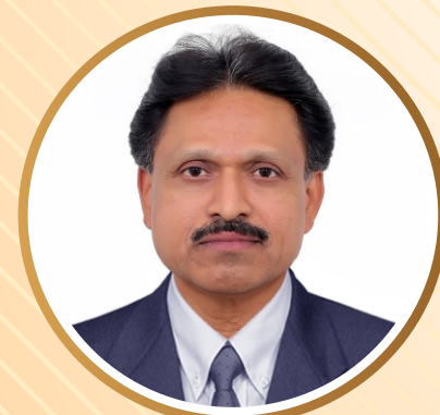
Guest of Honour

Director General, Central for Power Research Institute(CPRI) BENGALURU