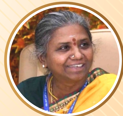
Guest of Honour

RajaRajeswari Group of Institutions, BENGALURU